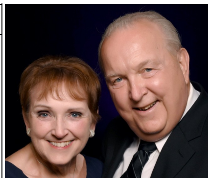
Round Dance Cuers